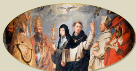
Defenders of the Eucharist, Rubens